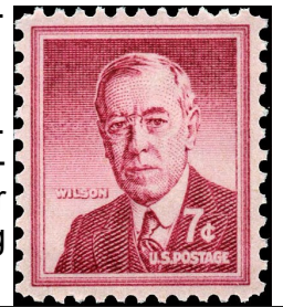
From the Liberty Series Scott #1040