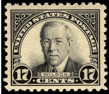
Mourning Stamp Woodrow Wilson Scott #623 & 697

The end of the year brings many challenges for a lot of us. Many of us may have large families with all the expenses that go with the holidays from Thanksgiving through to New Years. The local taxman(or woman) has their hand out . If you belong to almost any organized religion they are wanting your commitment or pledge for the next year. And of course, there are the many organizations that you may belong to with their hand out wanting you to renew your dues.